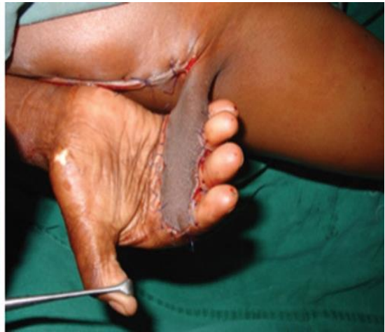
B) Release is done and resurfaced with Groin flap.