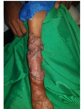
C) Release of right elbow with STSG