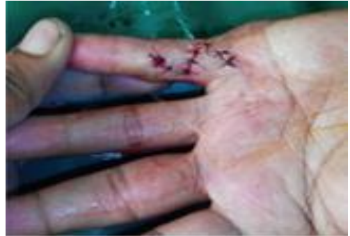
B) Released with two flap Z-plasty.