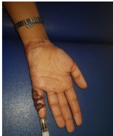
B and C) Contracture release with FTSG coverage and wire fixation.