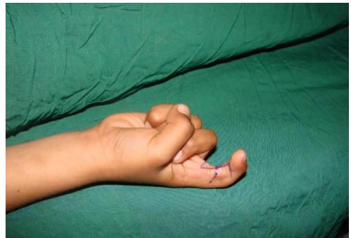
B) Released with four flap Z-plasty.