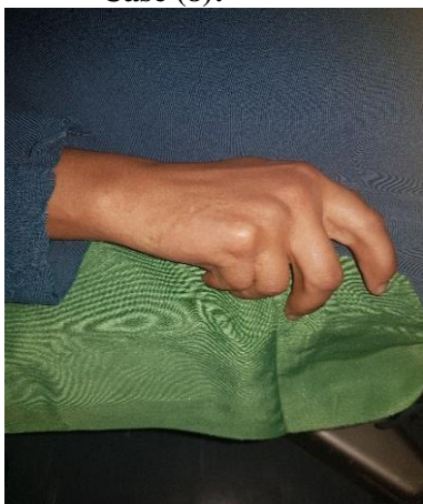
A and B) Rt post-burn contracture of volar surface of index to little fingers.