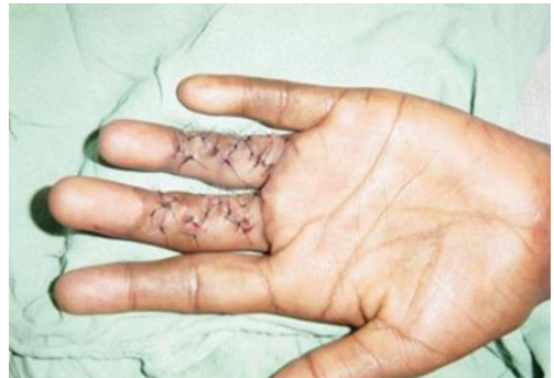
B) Released with four flap Z-plasty.