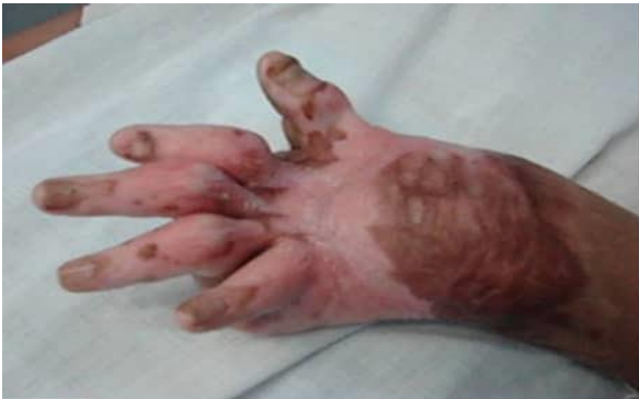
A) post-burn scar contracture of dorsal hand and fingers.