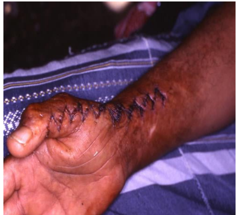
B) managed by release with multiple Z-plasty.