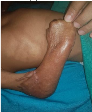
A) post-burn contracted right hand and elbow.