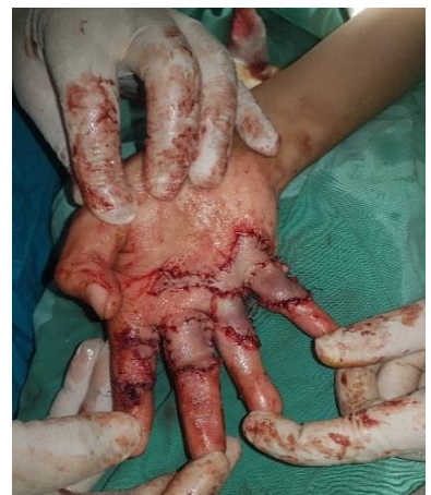
C) release of contractures and coverage by FTSG.