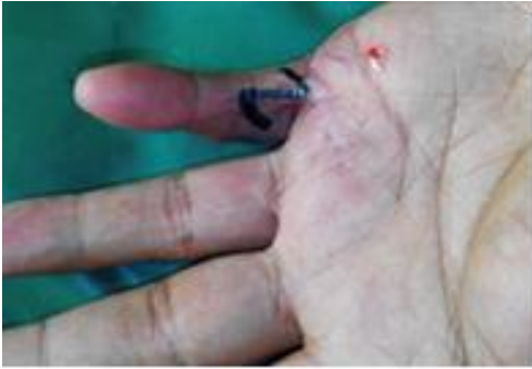
A) Post-burn contracture of left little finger.