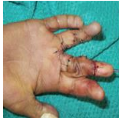
B) Release for ring finger by multiple Z-plasty and middle finger released and resurface by cross finger flap from dorsum of index finger.