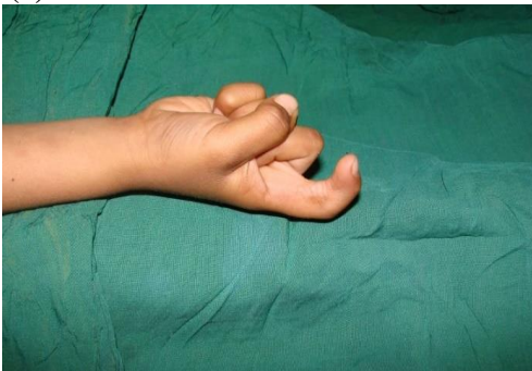
A) post-burn contracture of Rt index volar