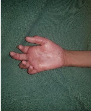
A) Rt post-burn contracture of volar surface of index to little fingers.