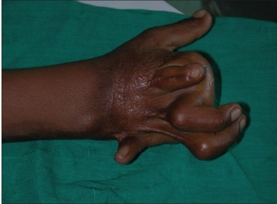
A) Severe Rt dorsal hand contracture.