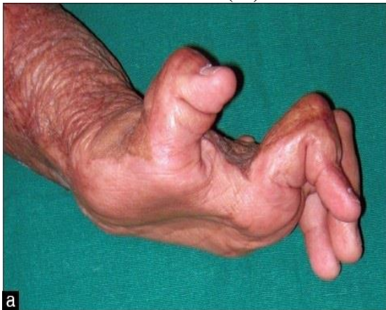
A) Severe dorsal contracture of the Lt hand.