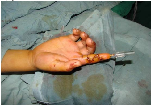
C) Stabilized with wire fixation.