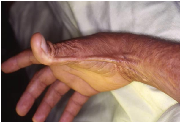
A) post-burn scar contracture for Rt distal arm, wrist and thumb.