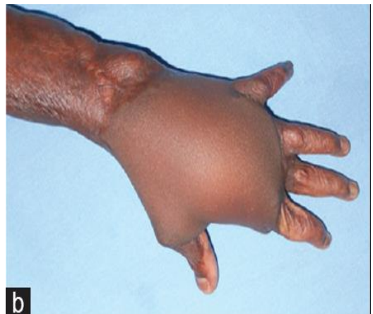
B) After release, the dorsal hand resurfaced with abdominal flap.