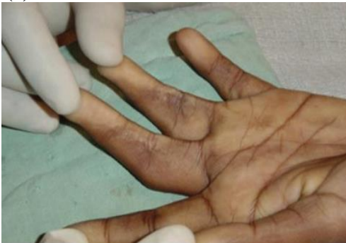
A- Post-burn contracture of left middle and ring fingers.