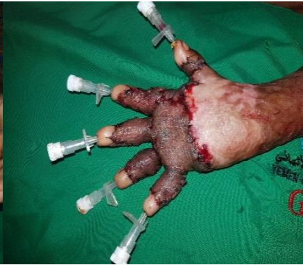
E) Rt hand after release and coverage with STSG and wire fixation.