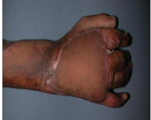
B) contracture release is done and covered with distally based radial forearm flap.