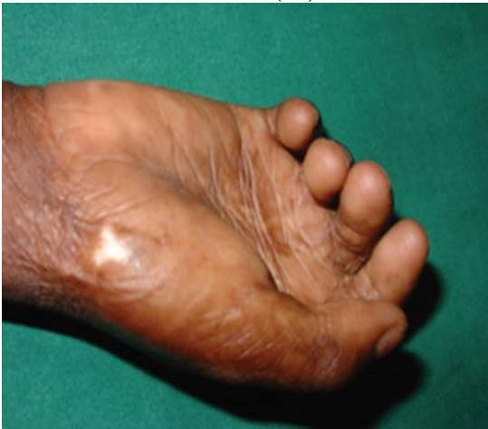
A) Post-burn contracture of volar aspect of Rt index to little fingers.