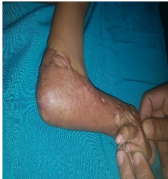
B) post-burn contracted left hand and elbow.