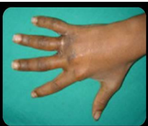
B) Post release of contracture with coverage by square flaps.