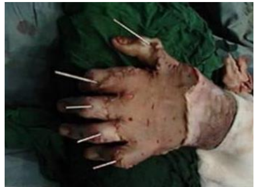
B) After contracture release and coverage by STSG with K-wires fixation.