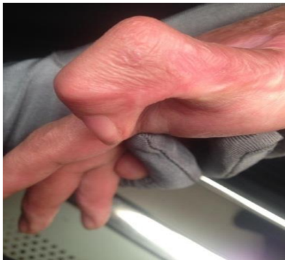
A) Contracture of left little finger volar surface.