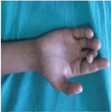
A) Post- electrical burn right middle and ring finger contractures.