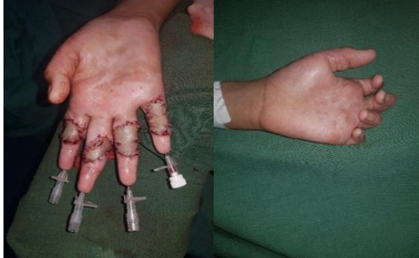
B) release of contractures and coverage by FTSG with wire fixation.