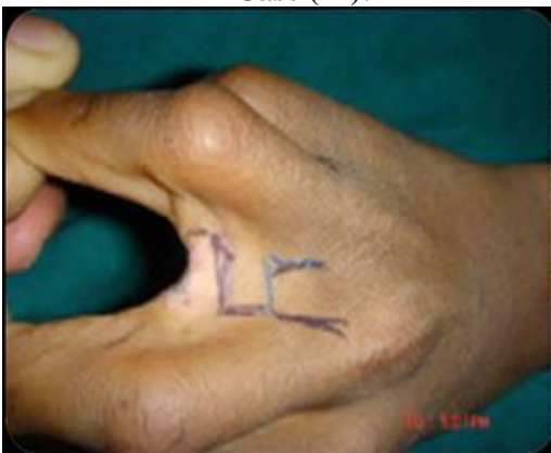
A) Post burn contracture of 2nd to 4th web spaces.