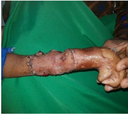
D) Release of left elbow with STSG.